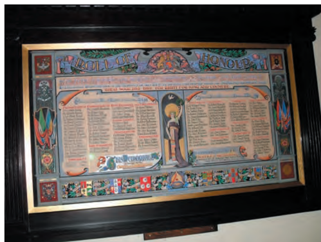
Bolton Temperance, Town Hall