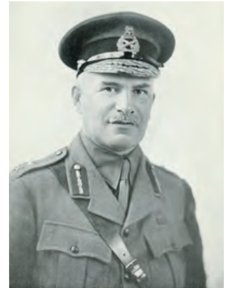
Sir Reginald Pinney KCB

Thus, in early 1916 the Division was serving in II Corps in Munroe’s First Army and performed reasonably well. Only small incidents such as