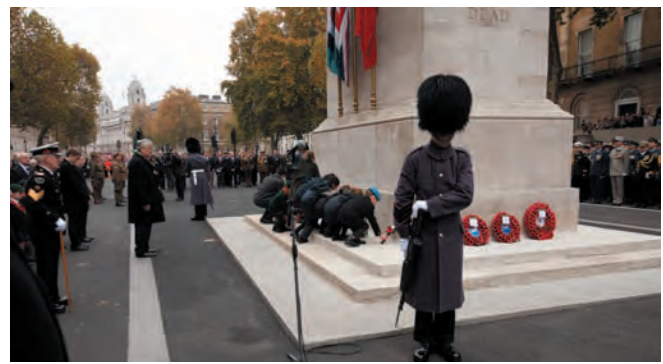
Children lay their wreaths on 11/11/11