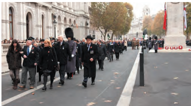
WFA members and friends march past the cenotaph on 11/11/11