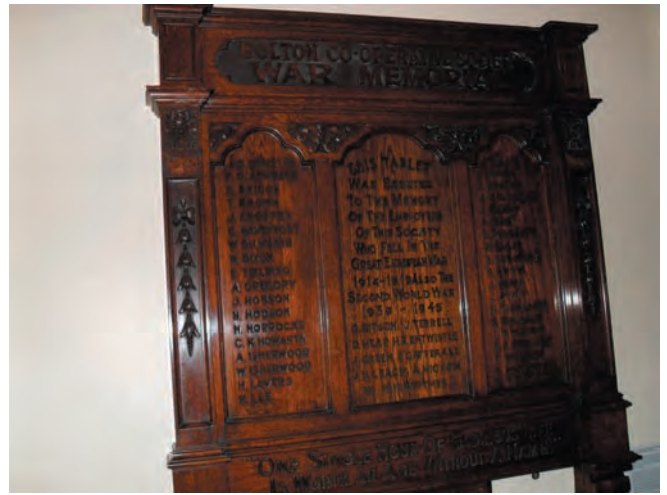
Bolton Co op, Town Hall