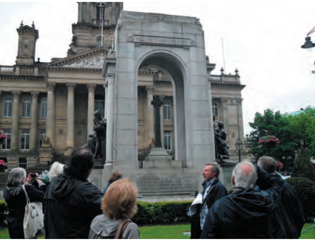
Bolton Civic Memorial