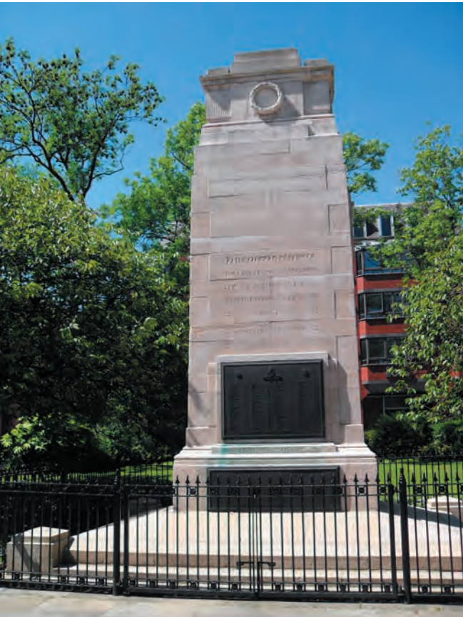
Bolton Artillery Memorial